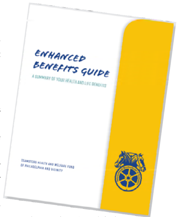
*New Member Packet Redesign*

In addition to the new Enhanced Benefits Guide, an updated Summary Plan Description, Dental Provider booklet and a member ID card for these carved out benefits will be included in the redesigned packet. When you receive your newly updated member packet, please take the time to review the benefits information enclosed. Questions about your benefits, please contact Member Services at 800-523-2846.